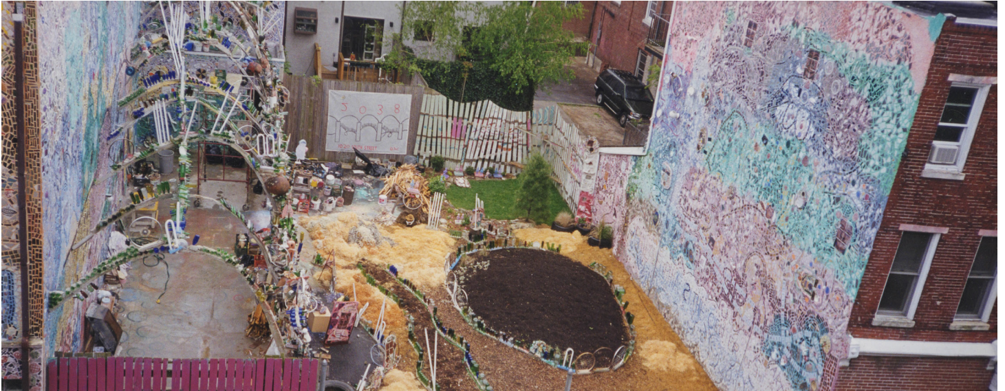
PHILADELPHIA'S MAGIC GARDENS BEING CONSTRUCTED, 1998

Unwilling to witness the destruction of the now-beloved neighborhood art environment, the community rushed to support the artist. In 2008, PMG opened to the public and visitors now have the opportunity to participate in tours, art activities, hands-on interpretive experiences, workshops, concerts, exhibitions, and much more.