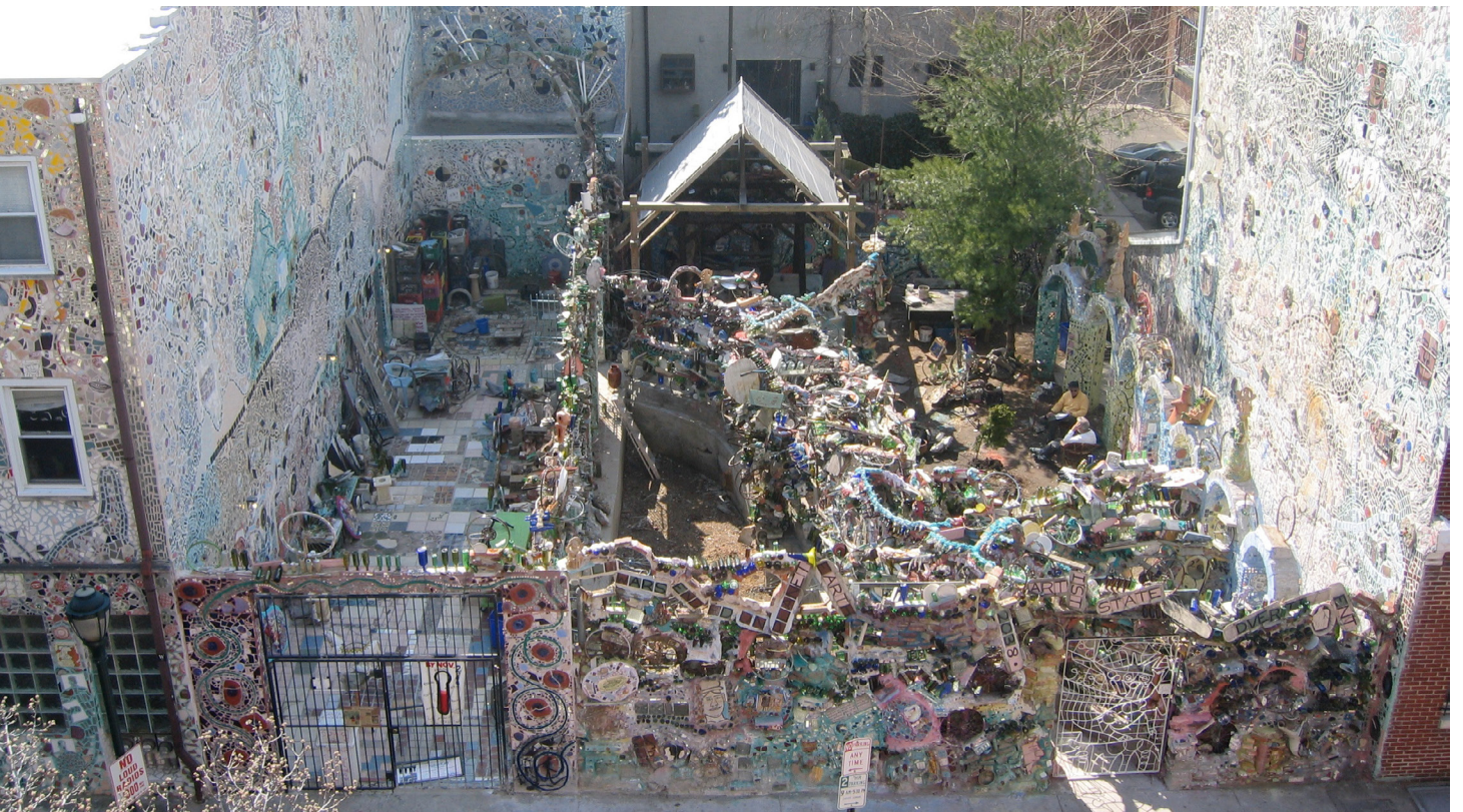
PHILADELPHIA'S MAGIC GARDENS' CONTINUED CONSTRUCTION, 2006