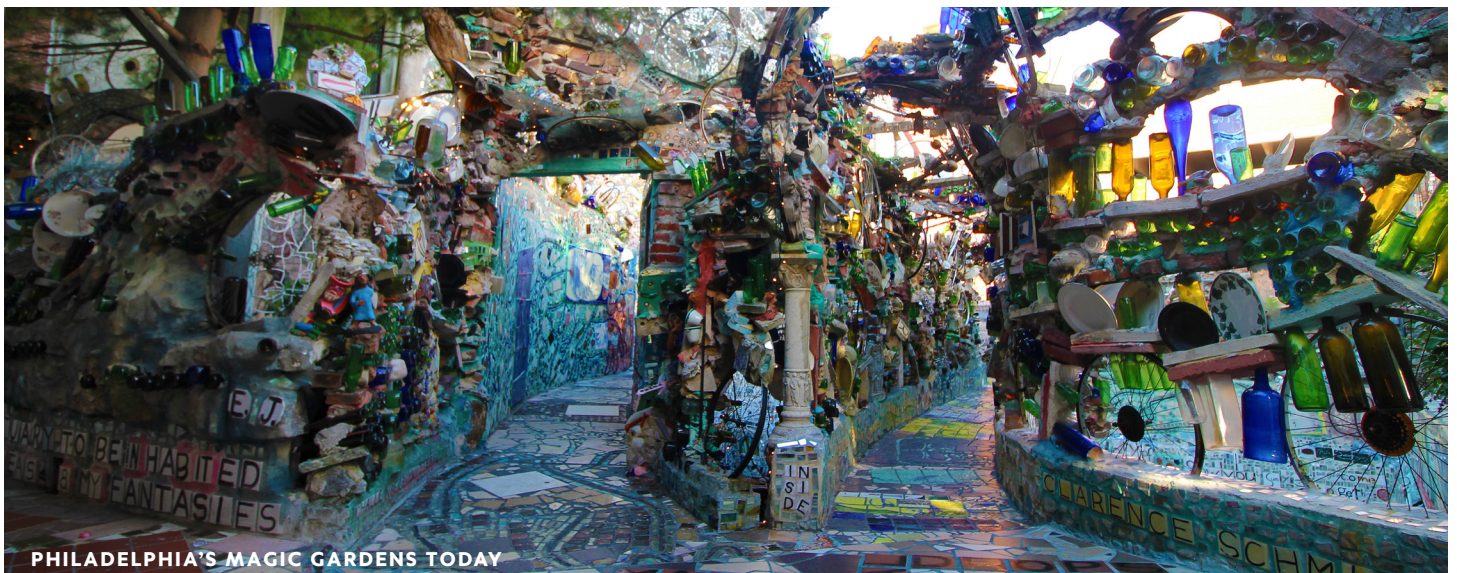
PHILADELPHIA'S MAGIC GARDENS TODAY

Philadelphia's Magic Gardens (PMG) is an immersive mixed media art environment that is completely covered with mosaics. It is the largest public artwork created by the Philadelphia-born artist Isaiah Zagar (born 1939). The site, which covers five city lots, is made up of two indoor galleries and a bi-level outdoor sculpture garden. It is constructed from handmade tiles, salvaged building materials, bottles, bicycle wheels, mirror, and international folk art. Isaiah also describes the work as a journal of his life, including images of friends and family, significant words and phrases, and artistic influences.