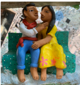
The Aguilar Family English and Spanish

Spotlight on specific Folk Artists important to PMG: