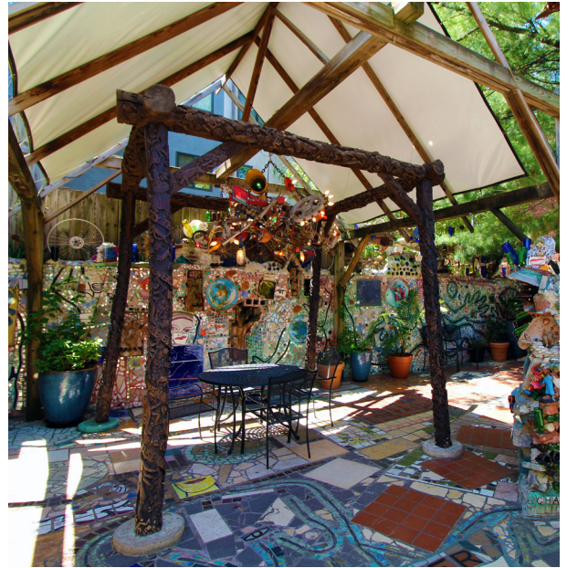
HUPPA, INSTALLED IN PMG'S SCULPTURE GARDEN