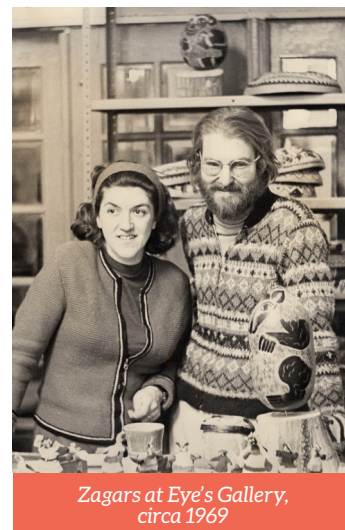
Zagars at Eye's Gallery, circa 1969