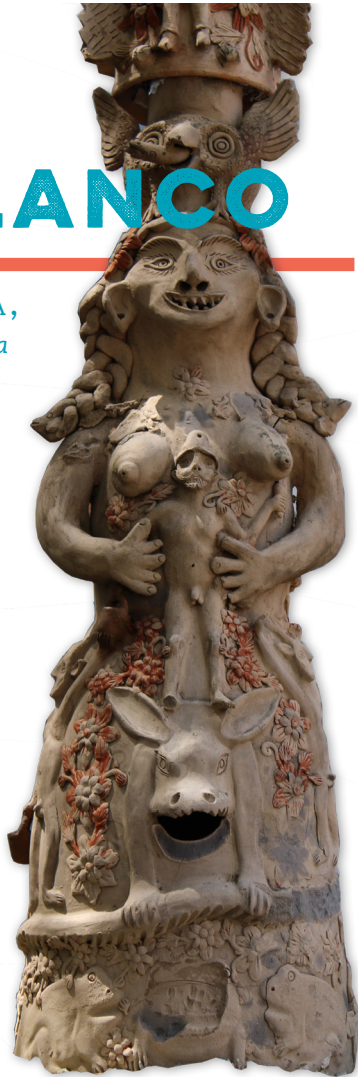
Totem by Irma Blanco

Irma worked with Isaiah to create the totems on top of the archways in the sculpture garden.