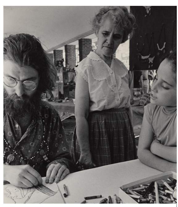
Isaiah Zagar at South Street Shambles, late 1960s